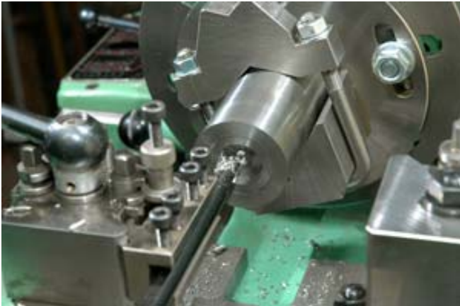
Photo.7 Boring The End of The Bar To Create a Bush

The Keats Angle Plate will hold a variety of shapes and sizes. It will often hold items for turning that would otherwise be very difficult indeed to hold securely in a chuck or on the faceplate. The extra rigidity of the Keats also enables turning to be carried out with a longer overhang than may be ideal, e.g. in order to bore the end of a bar, or to turn without a centre on the work. Photos 7 and 8 show a bush being bored and then parted off in direct drive on a Super 7 B.