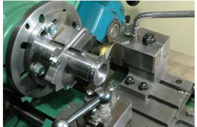
Photo.8 Parting Off The Bush.

Whilst the most usual place to use a Keats Plate is on the lathe faceplate, it could also be used on the lathe vertical slide in order to mill from the headstock. This type of mounting would probably only be appropriate with the smaller of the two available Keats plates.