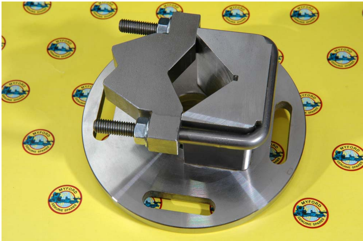
Myford Keats Angle Plate

A Keats angle plate is ideal for mounting large items and unevenly shaped castings onto the lathe faceplate for machining. Whilst most available Keats Angle Plates simply have small flanges to attach the unit to the faceplate, the Myford Keats Angle Plate features a full 360° flange for far greater rigidity. An additional advantage of this “full face” flange is that the unit is more balanced and it is far less likely that inconvenient stacks of balance weights will be needed to balance the faceplate. The angle plate is available in two sizes, intended for the 7” and 9” Myford faceplates respectively. The plate illustrated here is the 7” version and the rear flange is 135 mm (5¼”) diameter.