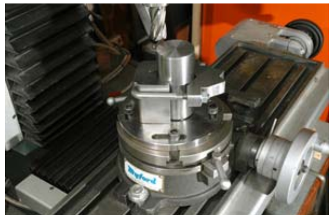
Photo.10 Preparing Work With The Keats Mounted on a Rotary Table

The Myford Keats Angle Plate may be obtained from our sales department or from our stand at one of the many Model Engineering Exhibitions along with a large selection of other Myford accessories.