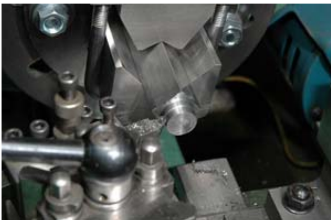
Photo.9 Turning a Square Bar

The Keats Angle Plate is equally useful on the milling machine table or alternatively fitted to the rotary table for making such things as dog clutches and hexagonal or castellated nuts. Photo. 10 shows work being prepared in this way on the milling machine of a customer.