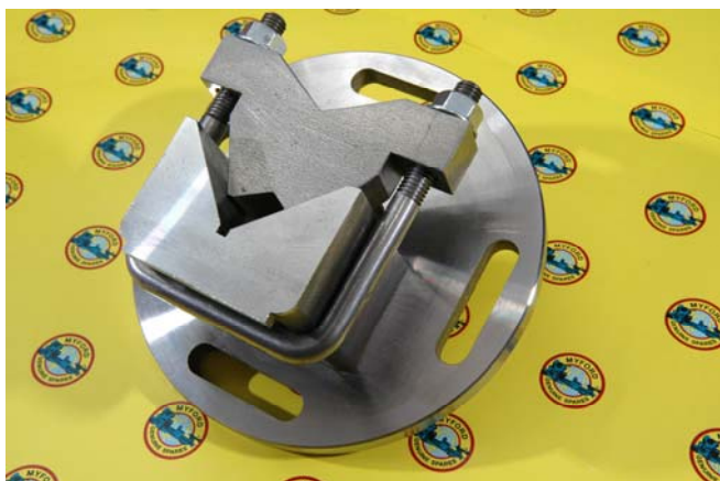
Photo.2 The Angle Plate Set Up For Smaller Diameter Items.

The moveable jaw may be reversed to accommodate items of smaller diameter as illustrated in Photo.2 and a through hole is provided in the rear flange to accommodate longer items which project into the headstock mandrel bore.