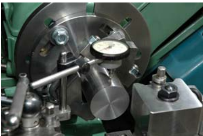
Photo.5 "Clocking" the Work Piece Central to the Lathe Axis Using a Dial Test Indicator.

Photo. 6 shows a "quick fix" which can often save time. Here the Keats plate has again been fixed loosely to the lathe faceplate and a home made "travelling steady", created specially for this purpose, has been placed in the toolpost. The steady simply consists of a ball bearing fixed on the end of a square steel bar. The toolpost is moved forward until the bearing touches the work piece as the lathe is rotated by hand and the steady is gradually moved forward whilst rotating the lathe by hand. Care must be taken with the tension in the mounting bolts. The bolts should just be tight enough to stop the Keats plate from sliding under its own weight, but slack enough to allow the Keats to slide on the faceplate until the work is central to the lathe axis. Again tapping with a soft hammer helps things along.