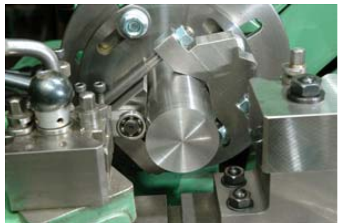
Photo.6 Using a Bearing Steady to Slide the Work Concentric With The Lathe Axis.